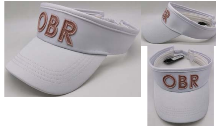
HY20961 White satin fabric, Embroidery logo on middle front panel. Elastic band closure.

If you want to customize hats, caps and accessories, please email to sales@hy-accessories.com www.hy-accessories.com