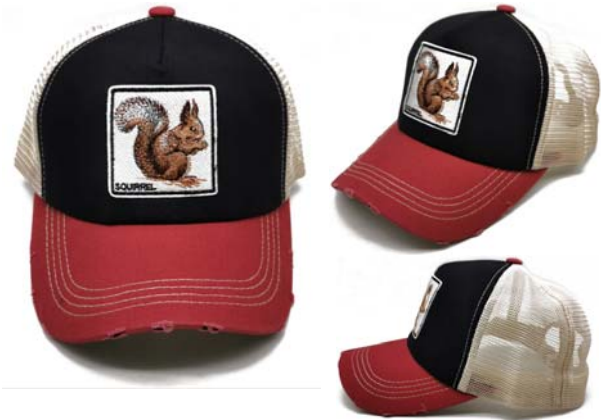
HY20954 Cotton twill fabric, broken visor, patched logo. Mid Pro,Structured Shape, plastic buckle closure. Cotton twill for sweatband.