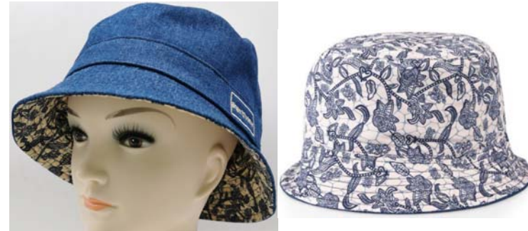
HY20967 100% cotton jean fabric, washed jean. High density embroidered logo on the band. Another side is polyester with allover print. Hat size 57cm.