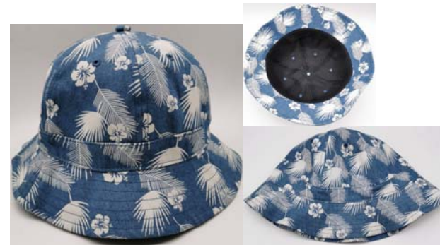
HY20971 100% cotton jean fabric, all over print. Hat size 58cm.