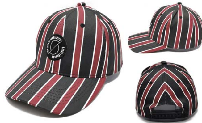
HY20936 Cotton twill fabric, embroidery logo on front. Printed black/white/burgundy stripes, Mid Pro, Structured shape, Plastic buckle closure. Cotton twill fabric for sweatband.