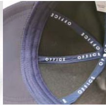
HY20924 Satin baseball cap Silver foil print