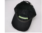
HY20914 washed cotton twill, black, broken style, silver clasp closure