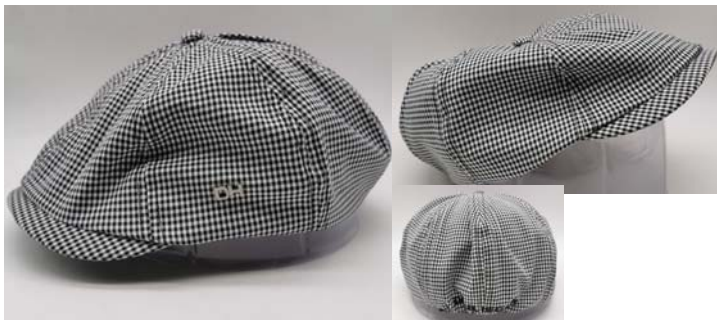
HY21027 Ivy caps, 8 panels cap, checked fabric, metal emblem on side. Elastic band Closure with embroidery logo.