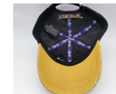
HY20915 Enzyme washed cotton twill, soft, silver clasp closure