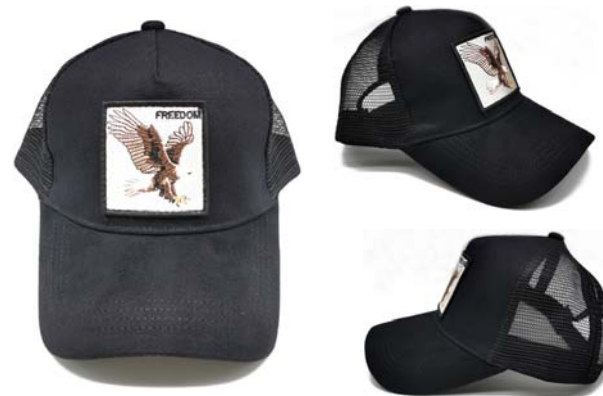
HY20957 Cotton twill fabric, patched logo. Mid Pro,Structured Shape, plastic buckle closure. Cotton twill for sweatband.

If you want to customize hats, caps and accessories, please email to sales@hy-accessories.com www.hy-accessories.com