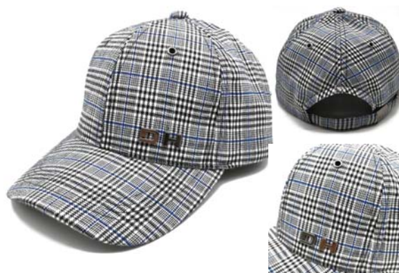
HY20933 cotton/linen fabric, Mid Pro,Structured Shape, 6 metal eyelets. Slide buckle closure. Cotton twill for sweatband. Metal matt studded.