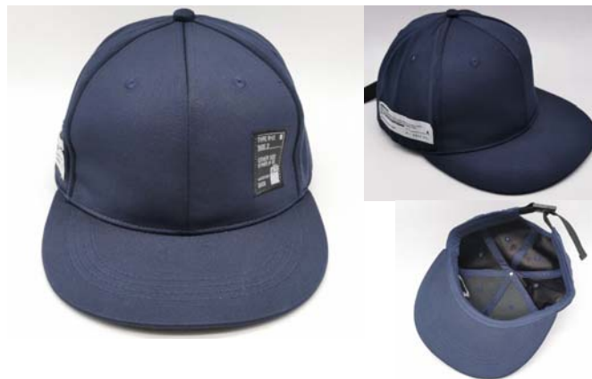
HY20988 Navy jersey fabric, patched logo on the both of side panels. High Pro Crown, Structured Shape. Plastic buckle with band at back closure.