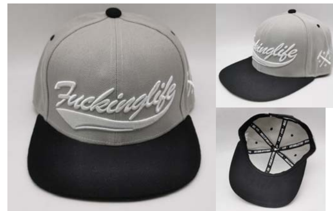
HY21017 Acrylic fabric, Emb. 3D embroidery on middle panels. Black eyelets, button and visor. High Pro Crown, Structured Shape. Snap back closure.

If you want to customize hats, caps and accessories, please email to sales@hy-accessories.com www.hy-accessories.com