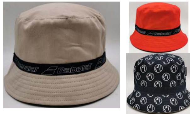
HY20969 100% cotton twill fabric, Tan and red available. Repeated printed logo on the band. Another side is cotton twill with allover print. Hat size 57cm, 59cm, 61cm available.

If you want to customize hats, caps and accessories, please email to sales@hy-accessories.com www.hy-accessories.com