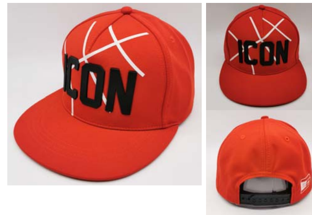
HY20985 Elastane polyester fabric, high raised print logo on middle front panel. High Pro Crown, Structured Shape. Snap back closure.

If you want to customize hats, caps and accessories, please email to sales@hy-accessories.com www.hy-accessories.com