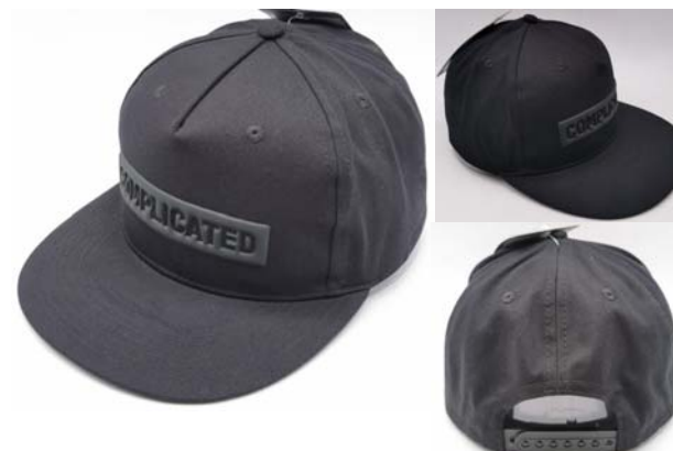
HY20991 Cotton twill fabric, embossed printed logo on front panels, snapback Closure. 58cm.