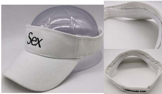
HY20962 White 100% cotton canvas fabric, High density embroidered logo on middle front panel. Cotton twill sweatband. Elastic band Closure.