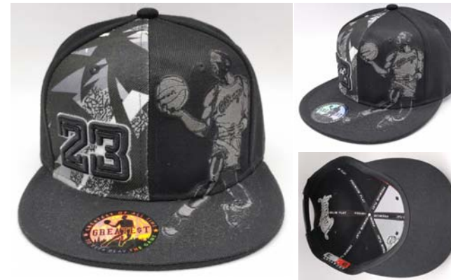
HY21003 acrylic fabric, 3d & flat embroidery logos on front and back panels, High Pro Crown, Structured Shape Snapback Closure. 59cm