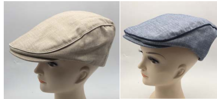
HY21028 Ivy caps. Linen fabric(97% polyester and 3% elastane). Closed closure. Three sizes available.

If you want to customize hats, caps and accessories, please email to sales@hy-accessories.com www.hy-accessories.com