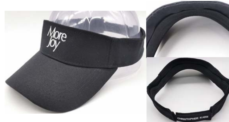
HY20963 Black 100% cotton canvas fabric, High density embroidered logo on middle front panel. Cotton twill sweatband. Elastic band Closure.