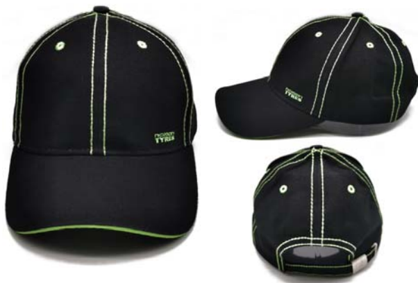
HY20946 Cotton twill fabric, high stitches allover cap. Sandwich insert into visor. Mid Pro, Structured Shape, self-fabric strap with silver buckle closure. Cotton twill for sweatband.