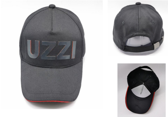
10428 Black cotton twill, 2c rubber logo printed on middle front panel. Mid Pro Crown, Structured Shape. Red sandwich. Antique silver clasp Closure with self fabric strap.