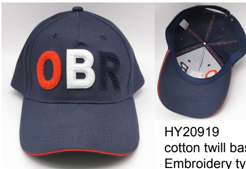
HY20919 cotton twill baseball cap Embroidery type: towel emb. + felt base