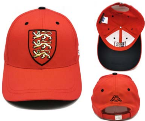
HY20948 Cotton twill fabric, high density 2d embroidery logo on front. Mid Pro, Structured Shape. Cotton twill sweatband. self-fabric strap with silver buckle closure.