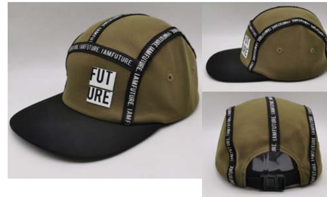
HY21011 creep cap, elastane fabric, printed tapes, pu label. 4 eyelets on both of size. nylon strap with plastic buckle to adjust size. 58cm.