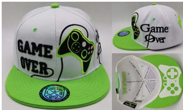
HY21000 Acrylic fabric, 3d embroidery logos on front and back panels, green eyelets and top button. High Pro Crown, Structured Shape Snapback Closure. 59cm.