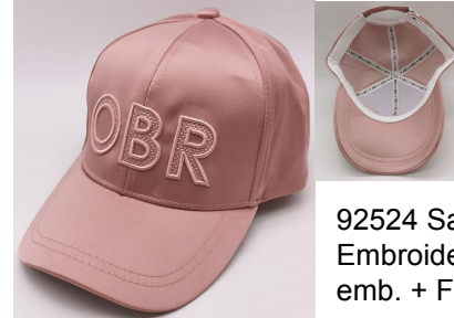
92524 Satin baseball cap Embroidery type: 3D Outline emb. + Flat texture emb.