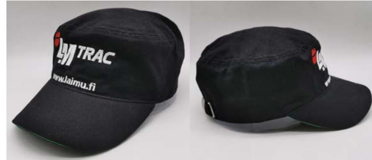
HY21026 Army cap, 100% cotton twill fabric, flat embroidery on front . sefl fabric strap with metal buckle at back Closure.