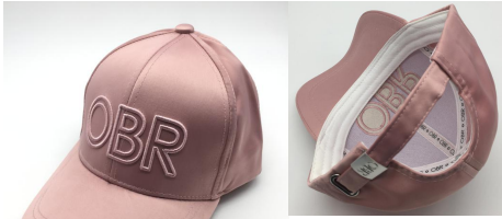
HY20916 Satin baseball cap Embroidery type: 3D Outline embroidery