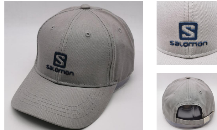
HY20904 Grey cotton twill, rubber logo printed on middle front panel. Mid Pro Crown, Structured Shape. Antique silver clasp Closure with self fabric strap.

If you want to customize hats, caps and accessories, please email to sales@hy-accessories.com www.hy-accessories.com