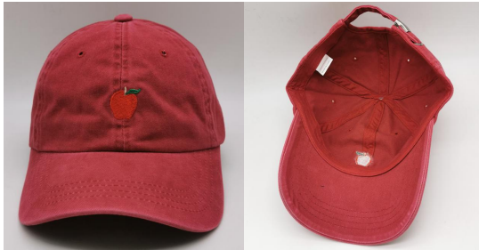
HY112189 Enzyme washed cotton twill, soft, burgundy, silver clasp closure