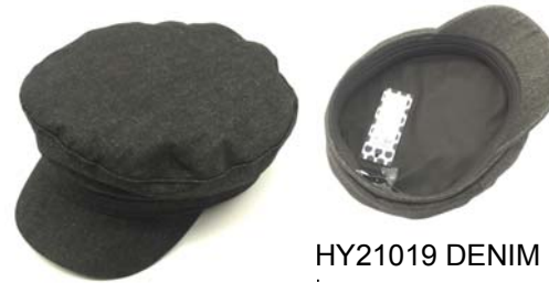
HY21019 DENIM BAKER BOY