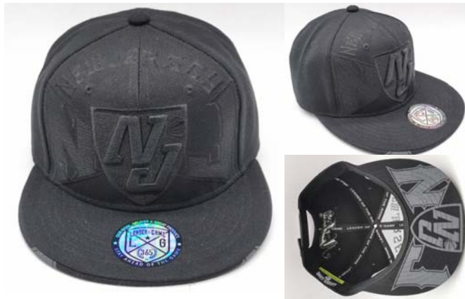
HY21008 acrylic fabric, 3d & flat embroidery logos on front and back panels, High Pro Crown, Structured Shape Snapback Closure. 59cm