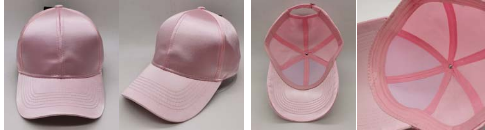
Colors collection for the style: