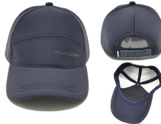
HY20939 nylon lycra fabric, print logo on front. Mid Pro, Structured shape, Plastic buckle closure. Cotton twill fabric for sweatband.