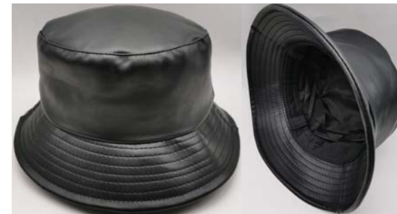
HY20973 PU bucket hat. lining is polyester fabric. Hat size 58cm.

If you want to customize hats, caps and accessories, please email to sales@hy-accessories.com www.hy-accessories.com