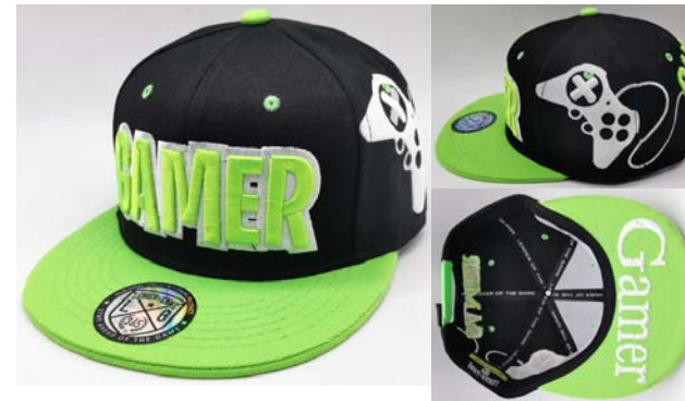
HY20999 acrylic fabric, 3d embroidery logos on front and back panels, green eyelets and top button. High Pro Crown, Structured Shape Snapback Closure. 59cm.