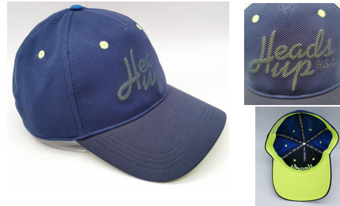
HY20906 Athletic soft mesh fabric, embroidered "75" on middle front panel with mesh cover. Mid Pro Crown, Structured Shape. Flexfit Closure. Printed brand tapes.

If you want to customize hats, caps and accessories, please email to sales@hy-accessories.com www.hy-accessories.com