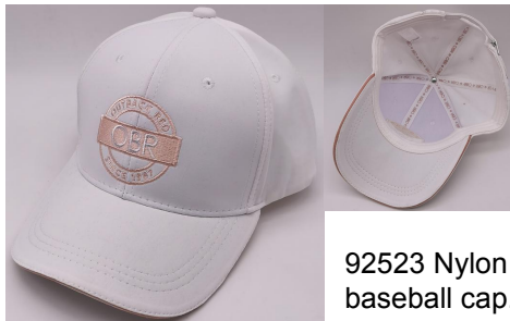
92523 Nylon stretched baseball cap. Embroidery type: Flat emb.