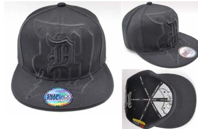
HY21005 acrylic fabric, 3d & flat embroidery logos on front and back panels, High Pro Crown, Structured Shape Snapback Closure. 59cm

If you want to customize hats, caps and accessories, please email to sales@hy-accessories.com www.hy-accessories.com