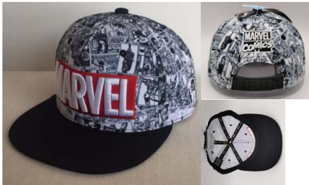
HY21014 Five panel cap, acrylic fabric, 3d embroidered on middle front and back panels. High Pro Crown, Structured Shape. Snapback Closure. Licensed Product.