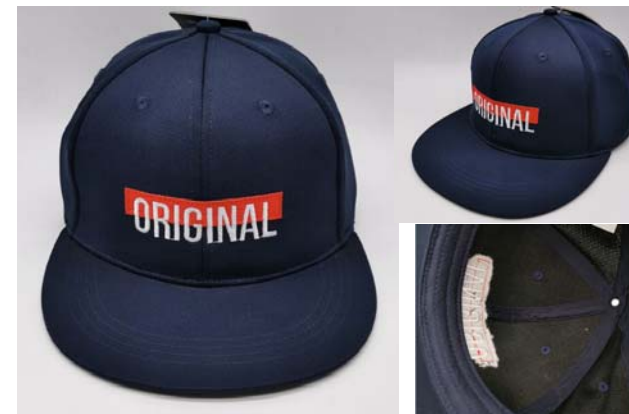
HY20989 Navy jersey fabric, patched logo on the front panels. High Pro Crown, Structured Shape. Plastic buckle with band at back closure.

If you want to customize hats, caps and accessories, please email to sales@hy-accessories.com www.hy-accessories.com