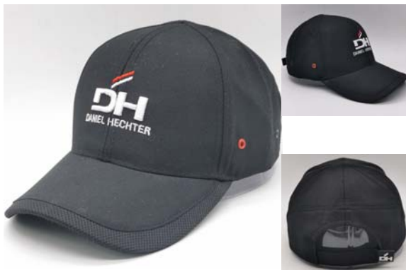
HY20922 Microfiber and mesh for visor edge, embroidery logo on front. Mid Pro, Structured Shape. Cotton twill sweatband. Velcro closure with rubber label.