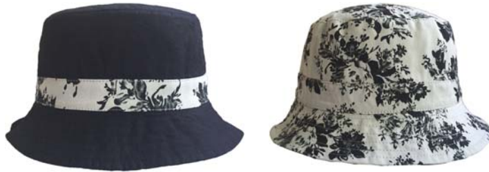
HY20966 100% cotton canvas fabric, reversible hat, hat size 58cm.