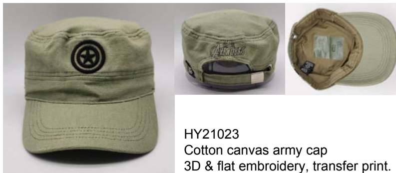
HY21023 Cotton canvas army cap 3D & flat embroidery, transfer print.