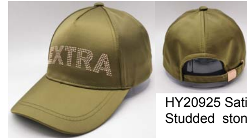
HY20925 Satin baseball cap Studded stones