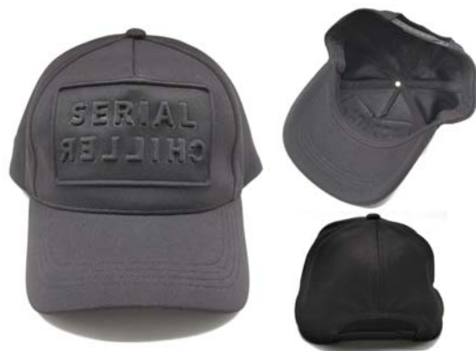
HY20940 Polyester mesh fabric, fabric embossed logo on front. Mid Pro, Structured Shape. Cotton twill sweatband. Plastic buckle closure.