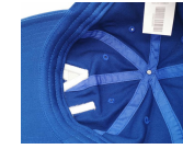
HY5385 washed cotton twill, blue, soft, slide buckle closure