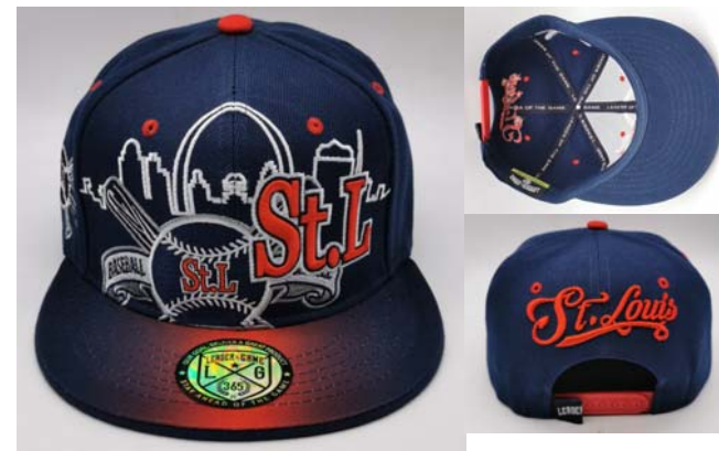
HY21007 acrylic fabric, 3d & flat embroidery logos on front and back panels, red eyelets and top button. High Pro Crown, Structured Shape Snapback Closure. 59cm