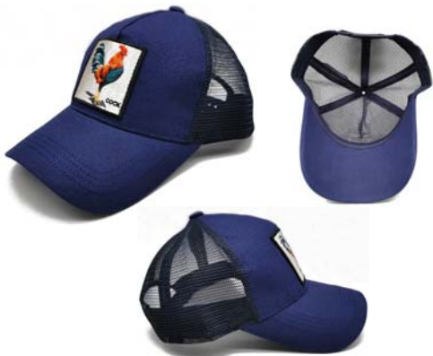
HY20956 Cotton twill fabric, patched logo. Mid Pro,Structured Shape, plastic buckle closure. Cotton twill for sweatband.