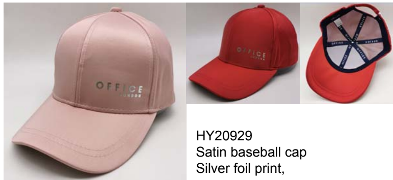
HY20929 Satin baseball cap Silver foil print,