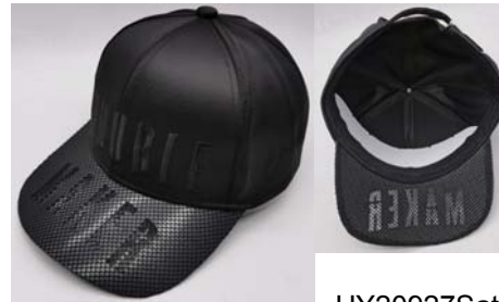
HY20927 Satin baseball cap Cutted visor with mesh covered.