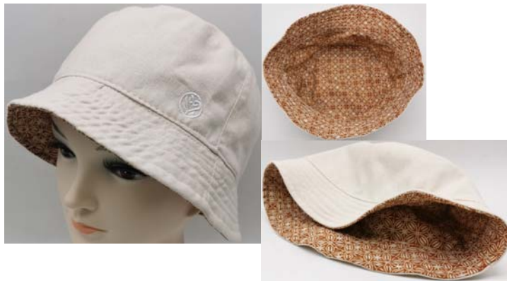
HY20968 100% cotton linen fabric. High density embroidered logo. Another side is polyester with allover print. Hat size 57cm.