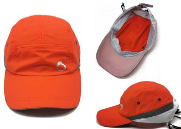
HY20949 anti-water sport fabric. 5 pael. Mid Pro, Unstructured Shape. sporting sweatband. self-fabric strap with plastic buckle closure.

If you want to customize hats, caps and accessories, please email to sales@hy-accessories.com www.hy-accessories.com