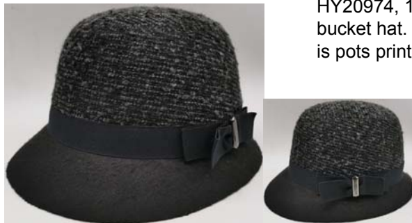
HY20972 Black/grey cloche hat. black band with bow and metal ignot. Hat size 57cm.