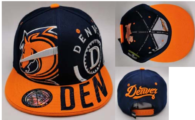
HY21006 acrylic fabric, 3d & flat embroidery logos on front and back panels, orange eyelets and top button. High Pro Crown, Structured Shape Snapback Closure. 59cm