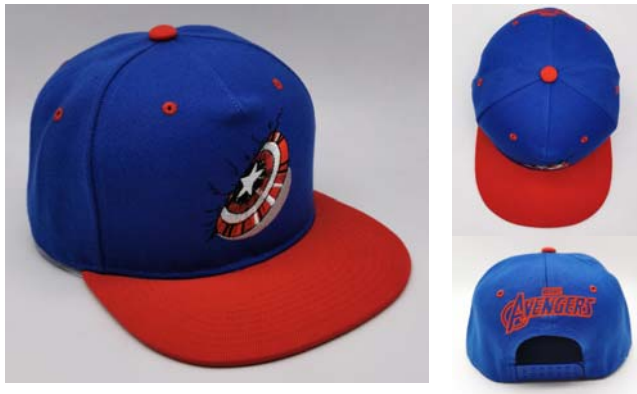
HY20978 Five panel cap, acrylic fabric, embroidered on middle front and back panels. High Pro Crown, Structured Shape. Snapback Closure. Licensed Product.