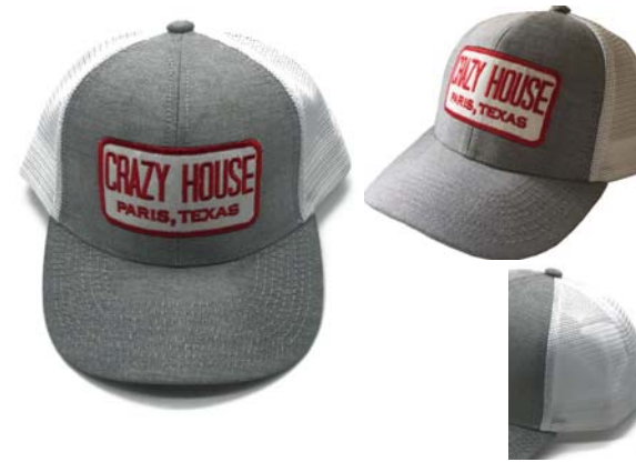
HY20951 Cotton canvas fabric, embroidery and patched logo on front. Mid Pro, Structured shape, plastic buckle closure. Cotton twill fabric for sweatband.