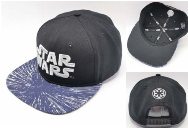
HY20980 Acrylic fabric, silver emb. "STAR WARS" on middle front panel. High Pro Crown, Structured Shape. Snapback Closure. Licensed Product.