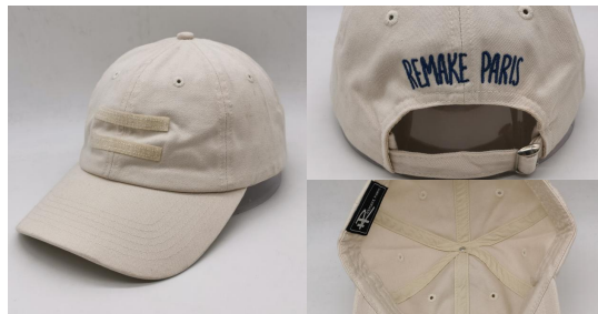
HY20913 washed cotton twill, beige, soft, slide buckle closure