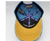
HY0817 Enzyme washed cotton twill, soft, silver clasp closure