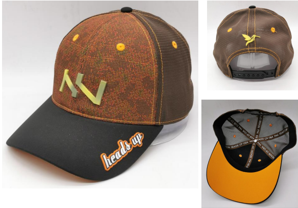
HY20907 Sublimation print fabric and soft mesh back, 3c rubber printed on visor and fading color raised print on middle front panel. Mid Pro, Structured Shape, Snapback closure.