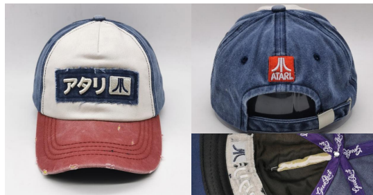
HY112192 Enzyme washed cotton twill, soft, silver clasp closure