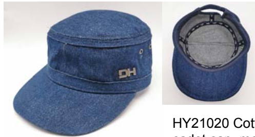
HY21020 Cotton jean cadet cap, metal eyelets & emblem, washed looking.