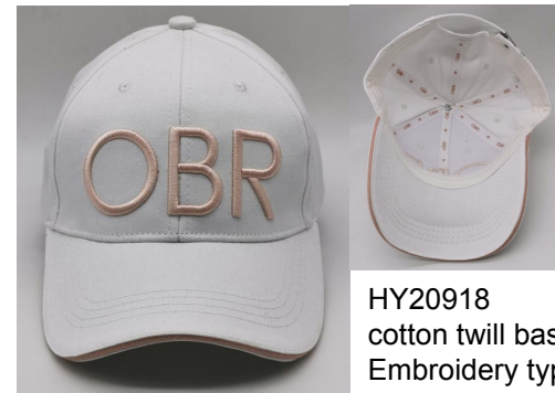
HY20918 cotton twill baseball cap Embroidery type: 3D emb.

If you want to customize hats, caps and accessories, please email to sales@hy-accessories.com www.hy-accessories.com