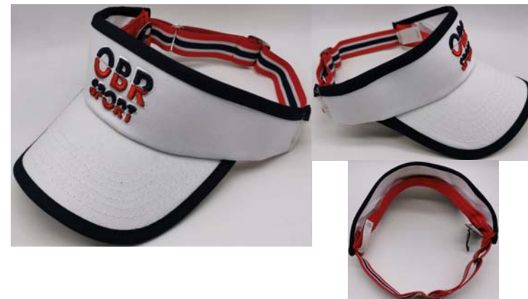
HY20965 White cotton twill fabric, Embroidery logo on middle front panel. Metal buckle with elastic band closure.

If you want to customize hats, caps and accessories, please email to sales@hy-accessories.com www.hy-accessories.com