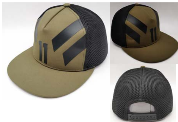
HY20990 Olive elastane fabric, printed logo on front, sandwich mesh for back panels. Snapback Closure. 58cm.