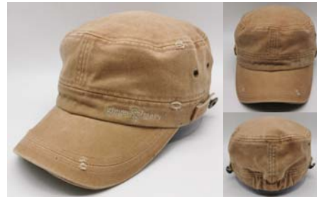
HY21021 Cotton twill cadet cap, washed/vintage style with broken effect.