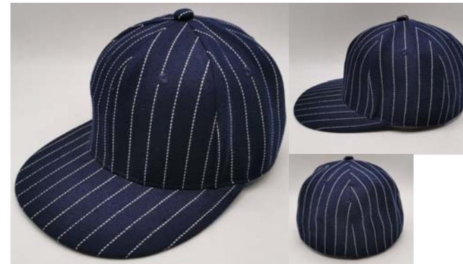
HY21013 Basic flat billcap, acrylic fabric. Closed back closure.

If you want to customize hats, caps and accessories, please email to sales@hy-accessories.com www.hy-accessories.com