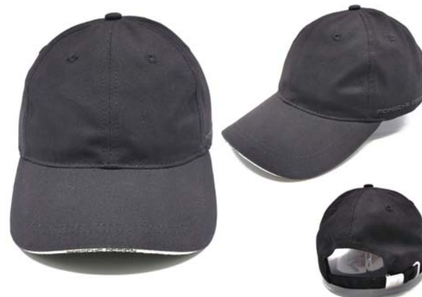
HY20947 Cotton canvas fabric, print logo on side. Mid Pro, Structured shape, self-fabric strap with silver buckle closure. Cotton twill fabric for sweatband.