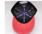
HY0815 Enzyme washed cotton twill, soft, silver clasp closure

If you want to customize hats, caps and accessories, please email to sales@hy-accessories.com www.hy-accessories.com