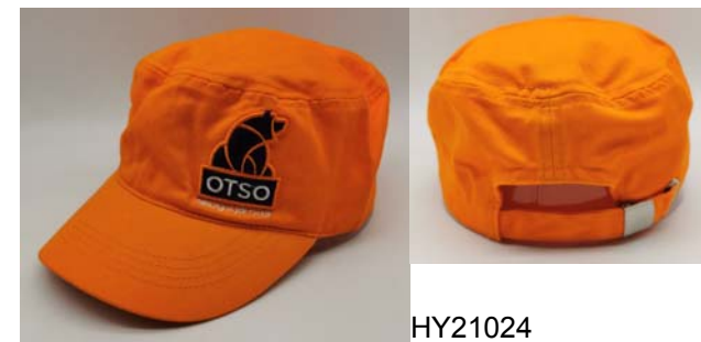
HY21024 Cotton twill army cap 3D embroidery.

If you want to customize hats, caps and accessories, please email to sales@hy-accessories.com www.hy-accessories.com