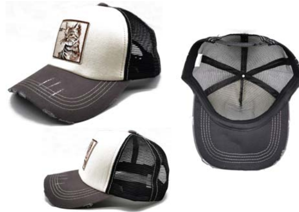
HY20955 Cotton twill fabric, broken visor, patched logo. Mid Pro,Structured Shape, plastic buckle closure. Cotton twill for sweatband.