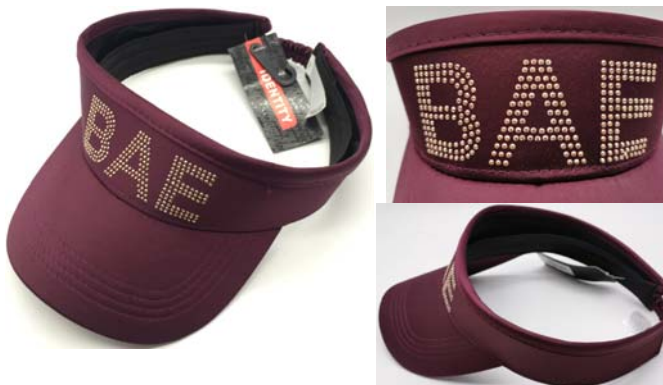
HY20964 Burgundy satin fabric, Stones studded logo on front panel. Elastic band Closure.