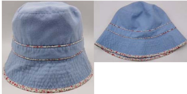
HY20970 100% cotton canvas fabric, hat size 58cm.