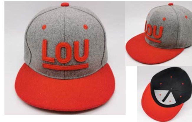
HY20987 melton fabric, flat embroidery logo on front, red eyelets and top button. closed Closure. 59cm.