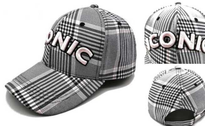
HY20932 cotton/linen fabric, Mid Pro,Structured Shape, 6 metal eyelets. Slide buckle closure. Cotton twill for sweatband. Perfect 3D embroidery brand.