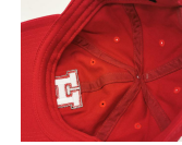
HY112191 washed cotton twill, red, soft, slide buckle closure