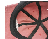
HY112188 Enzyme washed cotton twill, burgundy, slide buckle closure