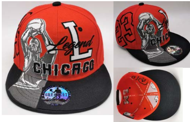
HY21002 acrylic fabric, 3d & flat embroidery logos on front and back panels, black eyelets and top button. High Pro Crown, Structured Shape Snapback Closure. 59cm.