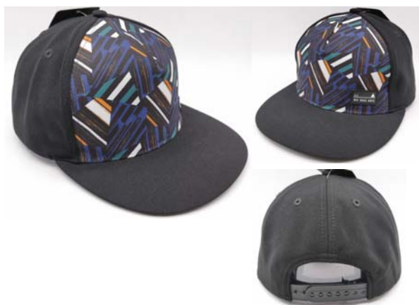
HY20992 Black elastane fabric, sublimated print on front panels. High Pro Crown, Structured Shape. Snap back closure.