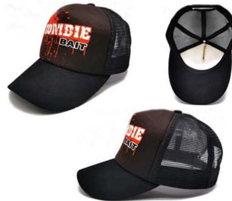
HY20953 Polyester fabric with foam, silk print logo on front. Mid Pro,. Cotton sweatband. Plastic buckle closure.

If you want to customize hats, caps and accessories, please email to sales@hy-accessories.com www.hy-accessories.com