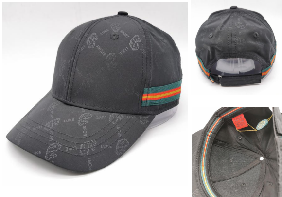
HY20909 "sport luke" allover print. Mid Pro, Structured Shape. 3c woven band at low & side panels. Cotton twill sweatband with 3c band. Silver loop closure with self fabric strap