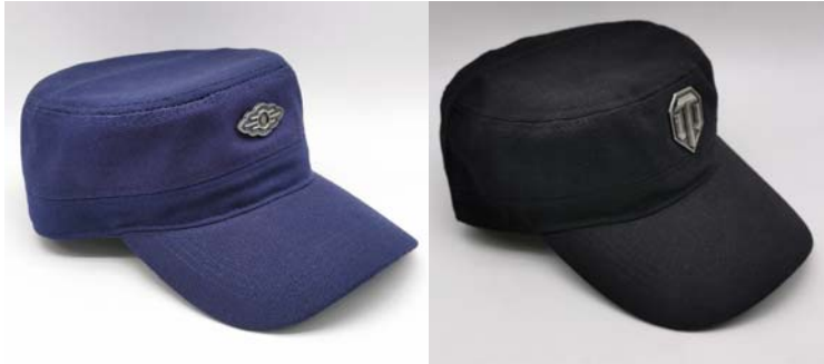
HY21025 Army cap, 100% cotton canvas fabric, metal emblem on front . sefl fabric strap with metal buckle at back Closure.