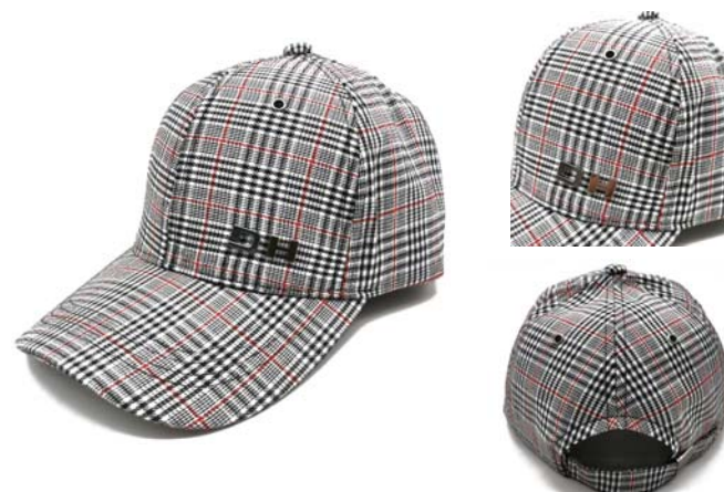
HY20934 cotton/linen fabric, Mid Pro,Structured Shape, 6 metal eyelets. Slide buckle closure. Cotton twill for sweatband. Metal matt studded.

If you want to customize hats, caps and accessories, please email to sales@hy-accessories.com www.hy-accessories.com