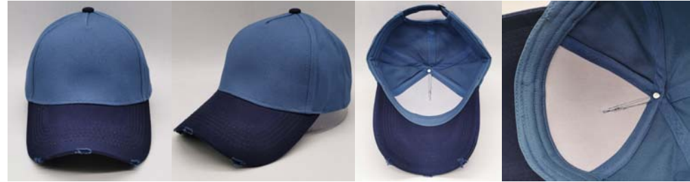
Colors collection for the style: