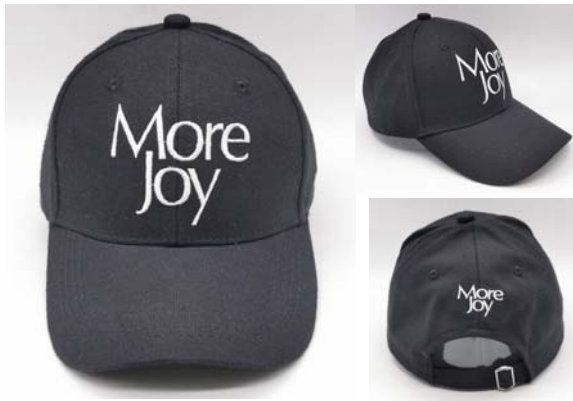
HY20920 100% cotton canvas fabric, high density flat embroidery on front and back. Mid Pro, Structured Shape, Slide buckle closure. Cotton twill for sweatband.