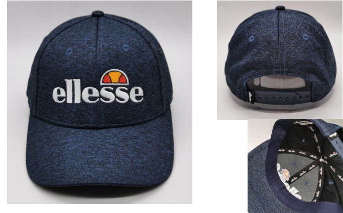
HY20910 Athletic Heather jersey, embroidery on middle front panel. Mid Pro Crown, Structured Shape. Mesh performance sweatband. Snapback Closure. Printed brand tapes.

If you want to customize hats, caps and accessories, please email to sales@hy-accessories.com www.hy-accessories.com