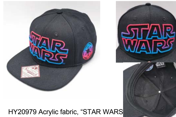
HY20979 Acrylic fabric, "STAR WARS" embroidery on middle front panel. High Pro Crown, Structured Shape. Snapback Closure. Licensed Product.