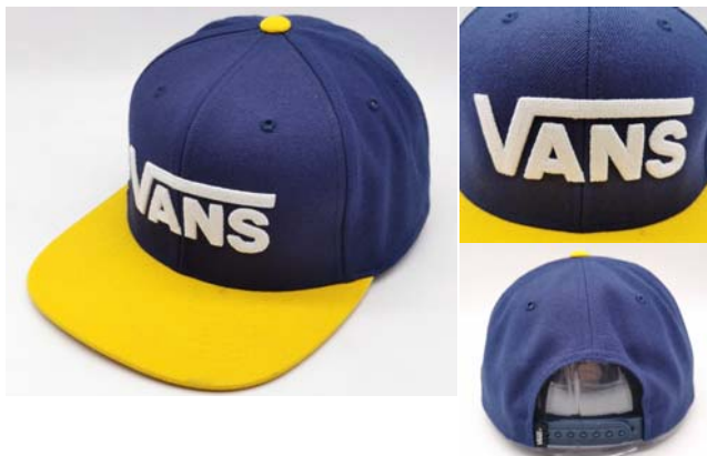
HY20984 Acrylic fabric, textiled emb. "VANS" on middle front panel. High Pro Crown, Structured Shape. Snapback Closure.