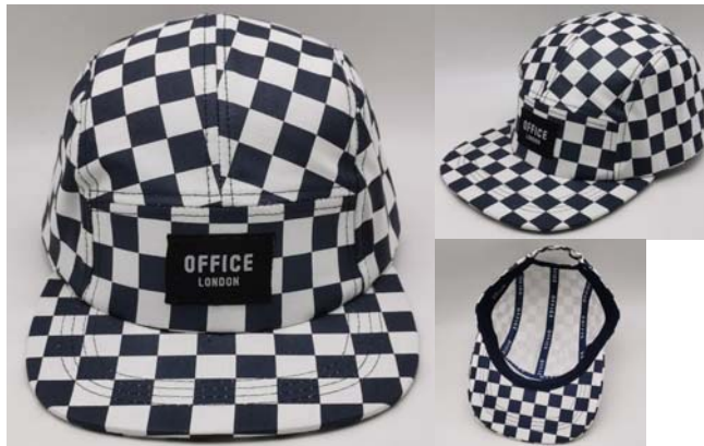
HY21012 Creep cap, Cotton twill fabric, white/black square overall printed, woven label patched. Self fabric strap with metal buckle closure. 58cm.