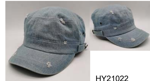
HY21022 Cotton jean cadet cap, vintage style with broken effect.