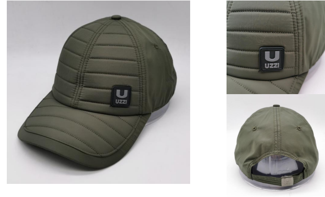
10424 Olive polyester microfiber, rubber badge sewed on front left panel. Mid Pro Crown, Structured Shape. Antique silver clasp Closure with self fabric strap. Quilting panels.