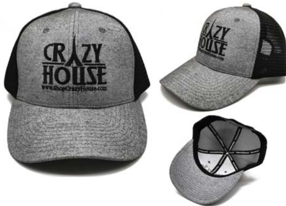
HY20950 Heather grey fabric, high density flat embroidery logo on front. Mid Pro, Structured Shape, plastic buckle closure. Cotton twill for sweatband.