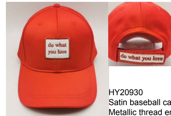
HY20930 Satin baseball cap Metallic thread embroidery.

If you want to customize hats, caps and accessories, please email to sales@hy-accessories.com www.hy-accessories.com