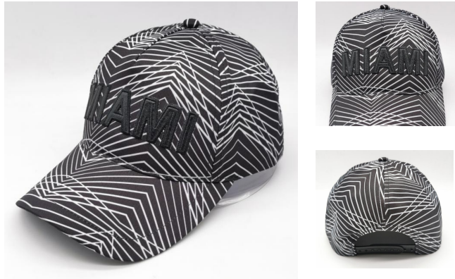
HY112200 Allover printed polyester fabric, PU made logo with embroidered edge on middle front panel. Mid Pro Crown, Structured Shape. Snapback Closure.