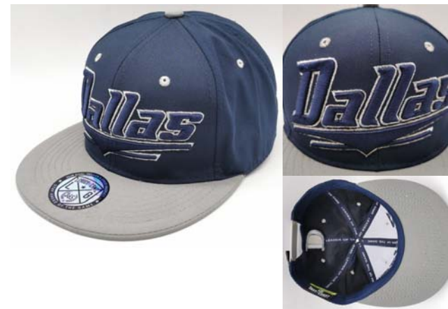
HY21001 Microfiber fabric, 3d embroidery logos on front and back panels, grey eyelets and top button. High Pro Crown, Structured Shape Snapback Closure. 59cm.

If you want to customize hats, caps and accessories, please email to sales@hy-accessories.com www.hy-accessories.com