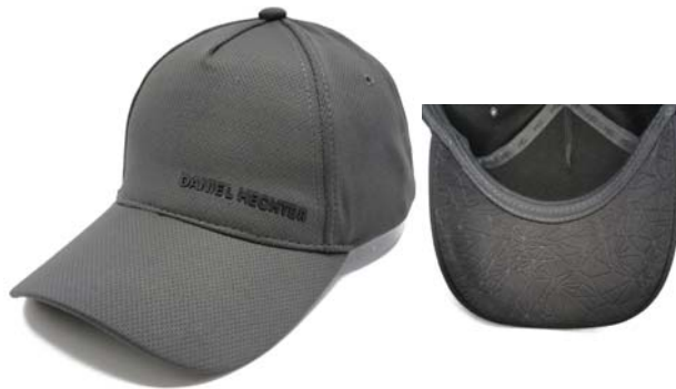
HY20936 Polyester mesh fabric, 3D print logo on front. Mid Pro, Structured Shape. Cotton twill sweatband. Embossed under the visor. Slide buckle closure.