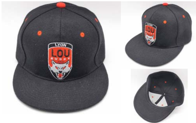
HY20986 melton fabric, flat embroidery logo on front, red eyelets and top button. closed Closure. 59cm.