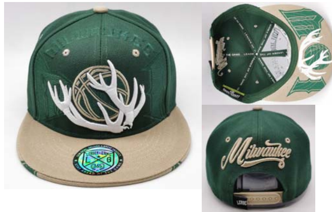
HY21004 acrylic fabric, 3d & flat embroidery logos on front and back panels, khaki eyelets and top button. High Pro Crown, Structured Shape Snapback Closure. 59cm