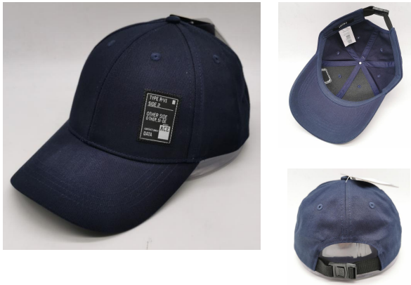
HY20905 Navy cotton twill, woven label sewed on front left panel. Mid Pro Crown, Structured Shape. Plastic clasp Closure with nylon band.