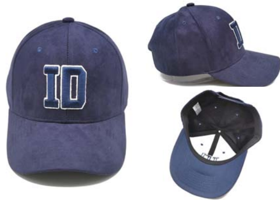
HY20935 Navy suede fabric, high density 3D embroidery on front. Mid Pro, Structured Shape, Plastic buckle closure. Cotton twill for sweatband.