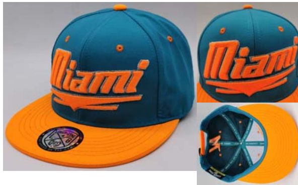
HY20998 Microfiber fabric, 3d embroidery logos on front and back panels, orange eyelets and top button. High Pro Crown, Structured Shape Snapback Closure. 59cm.