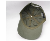
HY112186 washed cotton twill, soft, olive, silver clasp closure