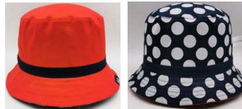
HY20974, 100% cotton twill reversible bucket hat. One size is red, another size is pots printed. Hat size 57cm.