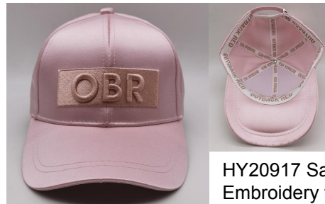
HY20917 Satin baseball cap Embroidery type: 3D emb. + Flat matting emb.