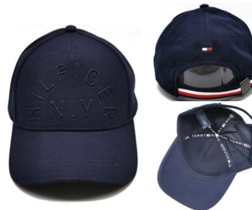
HY20941 Single jersey fabric. fabric embossed logo on front. Mid Pro, Structured Shape. Cotton twill sweatband. self-fabric strap with antique brass buckle closure.

If you want to customize hats, caps and accessories, please email to sales@hy-accessories.com www.hy-accessories.com