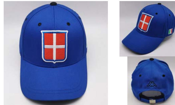
HY20921 Cotton twill fabric, embroidery logo on front, side and back. Mid Pro, Structured shape, Silver clasp closure. Cotton twill fabric for sweatband.