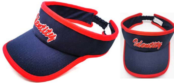
HY20958 Navy 100% cotton twill fabric, red edges piping, High density embroidered logo on middle front panel. Elastic band Closure.