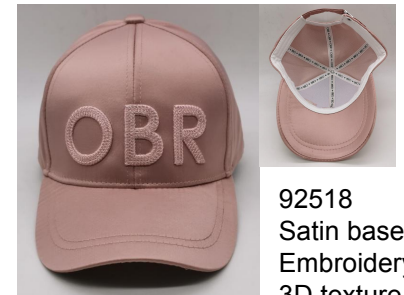
92518 Satin baseball cap Embroidery type: 3D texture emb.