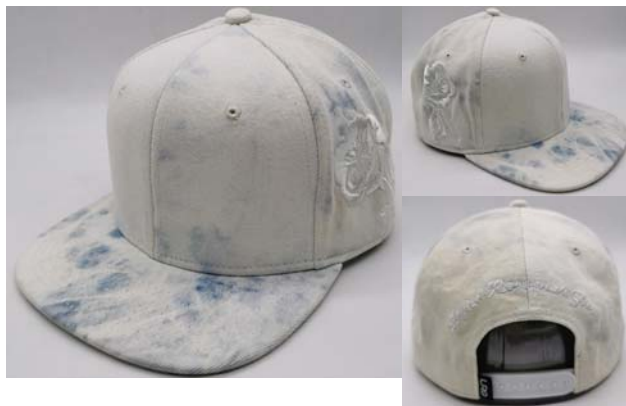
HY20996 Cotton jean fabric, embroidery logo on the both of side panels. High Pro Crown, Structured Shape. Snap back closure.