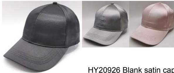
HY20926 Blank satin cap 100 colors available fabrics for all styles.