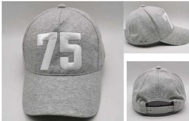
HY20903 Athletic Heather cotton jersey fabric, embroidered "75" on middle front panel. Mid Pro Crown, Structured Shape. Snapback Closure.