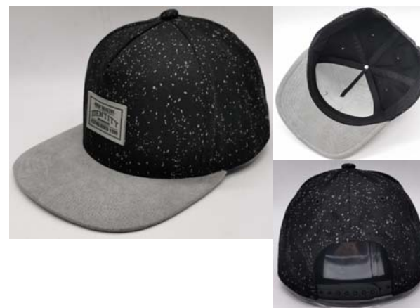
HY20993 cotton fabric for crown and suede for visor, patched logo on the front panel. High Pro Crown, Structured Shape. Snap back closure.

If you want to customize hats, caps and accessories, please email to sales@hy-accessories.com www.hy-accessories.com