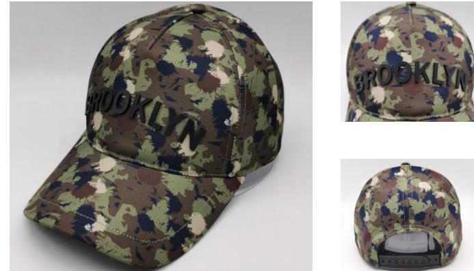
HY5381 Camouflage polyester fabric, "BROOKLYN" logo arc-shaped on middle front panel. Mid Pro Crown, Structured Shape. Snapback Closure.