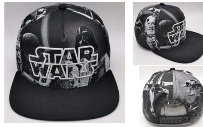
HY20981 Polyester fabric with all over print crown, Emb. "STAR WARS" on middle front panel. High Pro Crown, Structured Shape. Snap back closure. Licensed Product.

If you want to customize hats, caps and accessories, please email to sales@hy-accessories.com www.hy-accessories.com