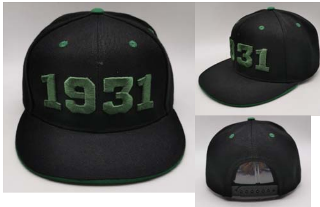
HY21010 Acrylic fabric, 3D embroidery logo on front, green eyelets, top button and underbill. Snapback Closure. 59cm.