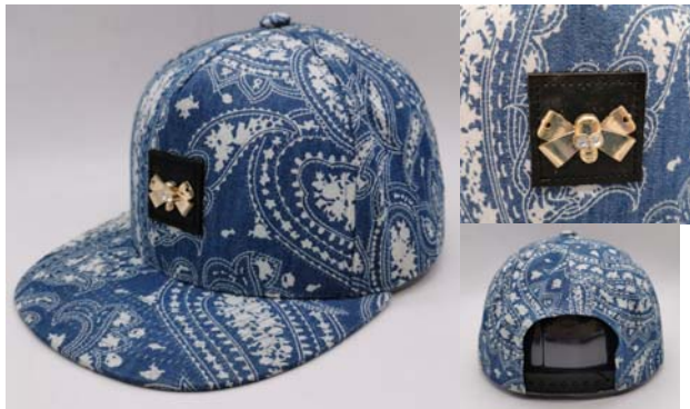
HY21016 fabric with flowers printed, pu patched with metal emblem on middle front panel. High Pro Crown, Structured Shape. Snapback Closure.