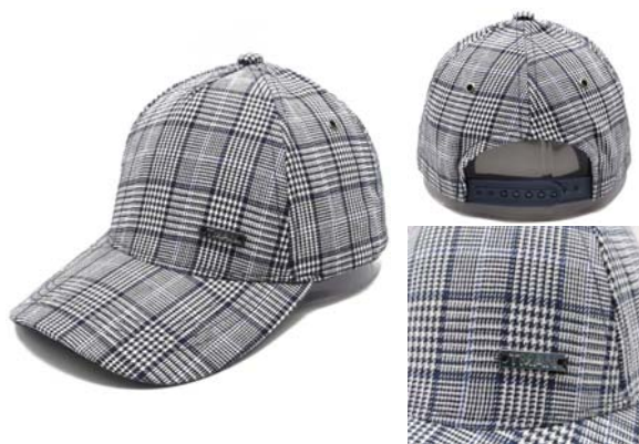
HY20931 cotton/linen fabric, Mid Pro,Structured Shape, Four metal eyelets. Plastic buckle closure. Cotton twill for sweatband. Metal matt sewed.