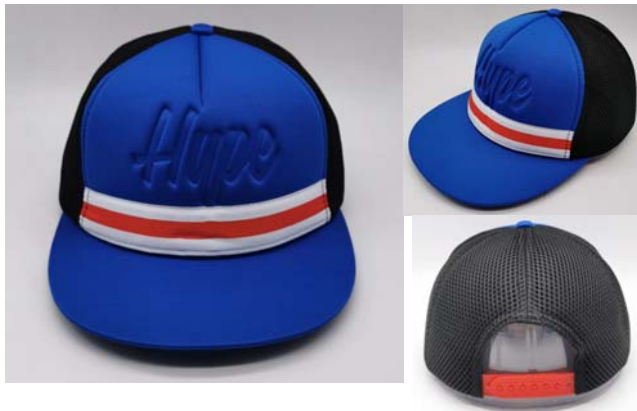
HY20982 Five panel cap, polyester fabric with foam for front panels and visor, embossed logo on middle front. High Pro Crown, wht/red/wht band sewed on front. Snapback Closure.