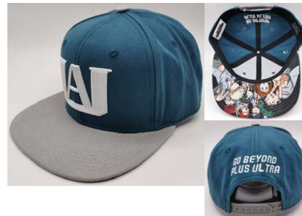
HY20997 Cotton canvas fabric for crown and cotton twill for visor and top button, 3d emb. logo on the front panels. Flat emb. logo on back. High Pro Crown, Structured Shape. Snap back closure.

If you want to customize hats, caps and accessories, please email to sales@hy-accessories.com www.hy-accessories.com