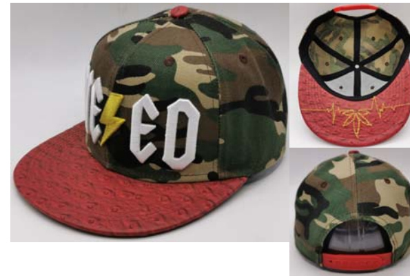
HY20995 acrylic fabric for crown and pu for visor and top button, 3d embroidery logo on front. Snap back Closure. 59cm.