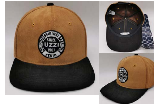
HY21009 Brown suede fabric for crown and black suede fabric for visor, flat embroidery logos on front panels, High Pro Crown, Structured Shape Snapback Closure. 59cm

If you want to customize hats, caps and accessories, please email to sales@hy-accessories.com www.hy-accessories.com