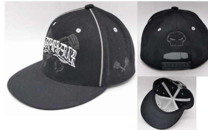
HY21015 Melton fabric, flat embroidery logo on middle front panel. Structured Shape. Snapback Closure.