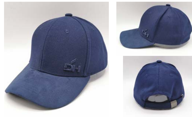
HY20923 Navy cotton canvas for cap and suede for visor. Embroidery logo on front. Mid Pro, Structured Shape. Cotton twill sweatband. Silver clasp closure with self fabric strap.

If you want to customize hats, caps and accessories, please email to sales@hy-accessories.com www.hy-accessories.com