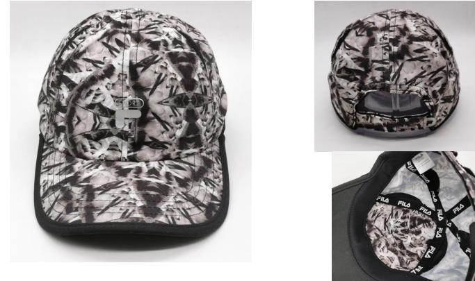
HY20908 Athletic allover print fabric, low pro, unstructured shape. Velcro Closure with self fabric strap. Mesh performance sweatband.