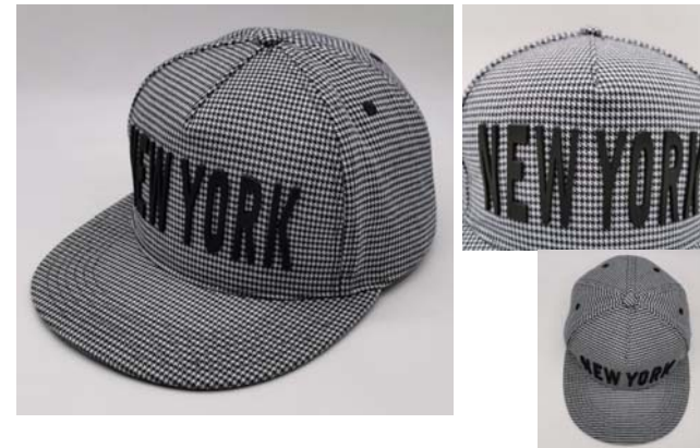
HY20983 Cotton/polyester blended fabric, "NEW YORK" logo printed on middle front panel. High Pro Crown, Structured Shape. Snapback Closure.