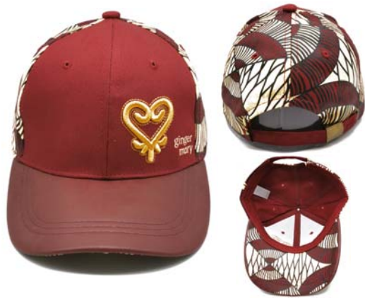
HY20938 Cotton twill fabric, high density 3D embroidery on front. Printed back panels and under visor. Mid Pro, Structured Shape, self-fabric strap with antique brass buckle closure. Cotton twill for sweatband.