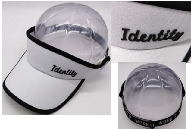
HY20960 white 100% cotton twill fabric, black edges piping, 3D printed logo on left front panel. Elastic band Closure with jacquard weave logo.