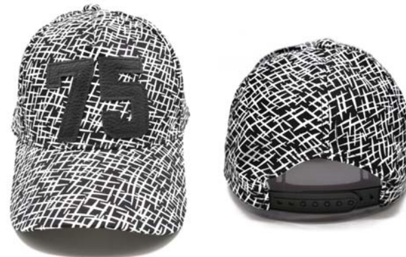
HY20937 Allover print fabric. Patched logo on front. Mid Pro, Structured Shape. Cotton twill sweatband. Plastic buckle closure.

If you want to customize hats, caps and accessories, please email to sales@hy-accessories.com www.hy-accessories.com