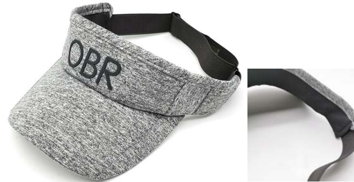
HY20959 Melange grey jersey fabric, "OBR" 3D printed logo on middle front panel..Elastic band Closure.