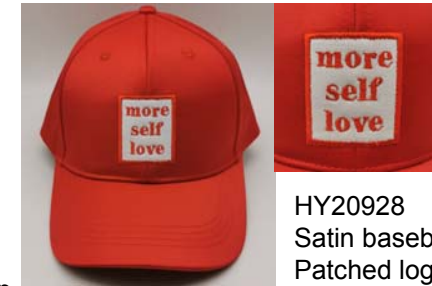
HY20928 Satin baseball cap Patched logo with embroidery.