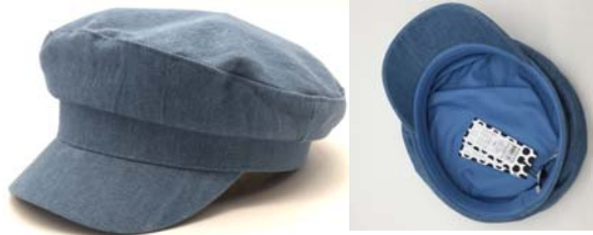
HY21018 DENIM BAKER BOY HAT