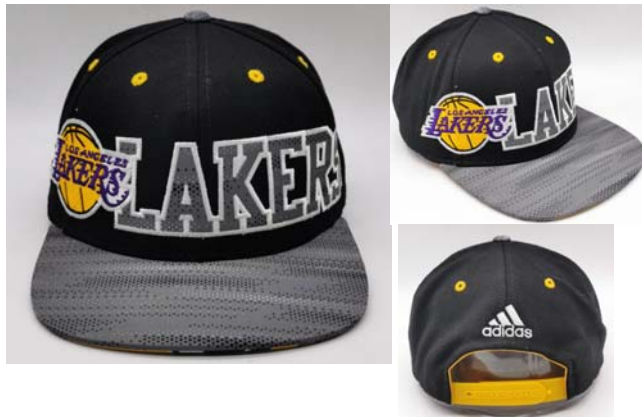
HY20994 cotton fabric, flat embroidery logo on front and back panels, yellow eyelets. Grey potted fabric for visor and top button. Snap back Closure. 59cm.