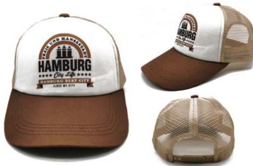
HY20952 Polyester fabric with foam, silk print logo on front. Mid Pro,. Cotton sweatband. Plastic buckle closure.