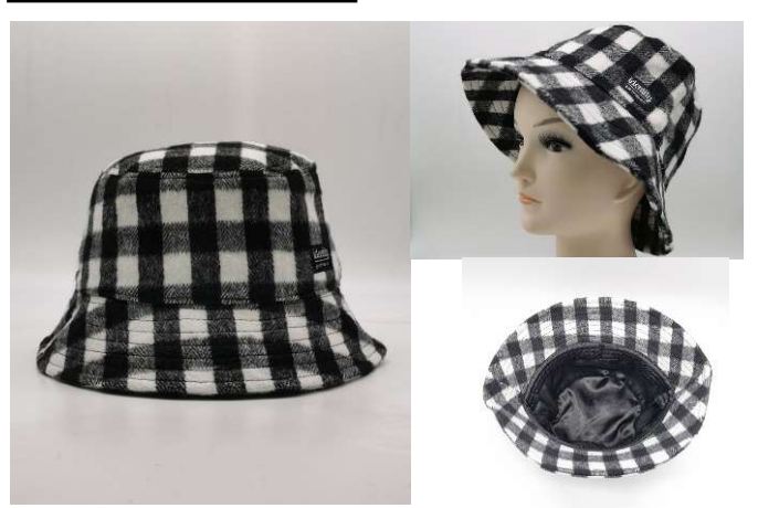
HY21009 Rpet wiinter checked fabric with satin lining bucket hat. Woven label on left side. Hat size 57cm.