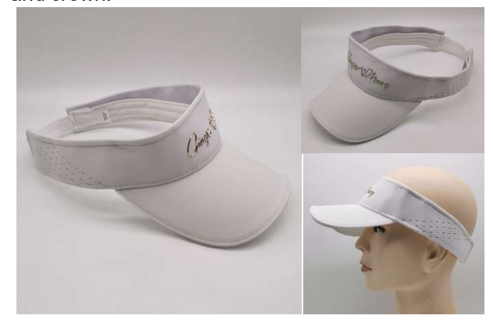
HY20997 White spandex fabric, TPU branding on middle front panel. Laser cut hole on both side Velcro back closure. Hard crown.