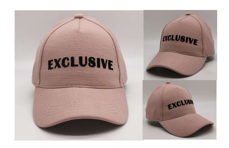
HY20940 Jersy fabric. Flocking logo on front panel. Low Pro, Structured Shape. Polyesteer twill sweatband. Plastic buckle closure.