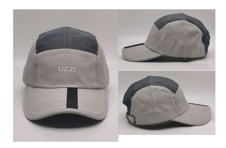
HY20949 Nylon fabric, 3D rubber print on front and flat print on up visor. Leisure shape, Branded print on inside tape. Branded metal buckle closure. Polyester twill for sweatband.