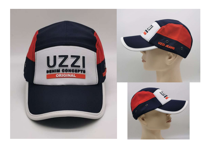
HY20950 Spandex fabric, 3D rubber print on front, left side . Leisure shape, Branded print on inside tape. Branded metal buckle closure. Polyester twill for sweatband.