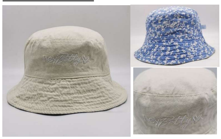
HY21007 Washed cotton canvas fabric reversible bucket hat. Woven label and high density flat embroidery on both side. Hat size 57cm.