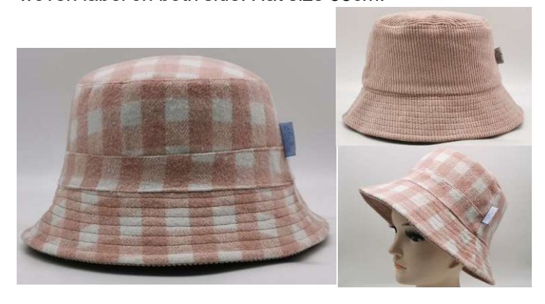
HY21001 Rpet winter checked fabric with corduroy reversible bucket hat. woven label on both side. Hat size 57cm.