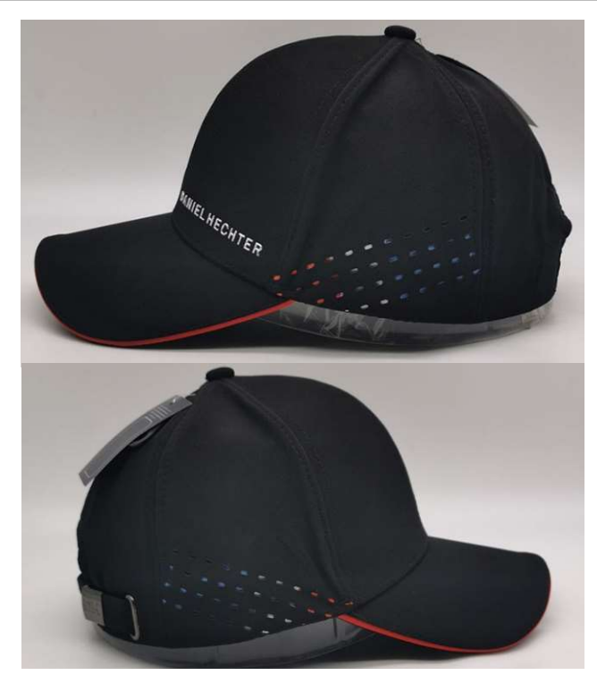
Other popular colors collection for the style: Navy, Light Grey, Dark Grey