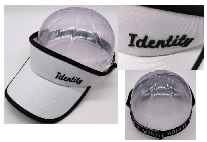
HY20960 white 100% cotton twill fabric, black edges piping, rubber printed logo on left front panel. Elastic band Closure with jacquard weave logo.