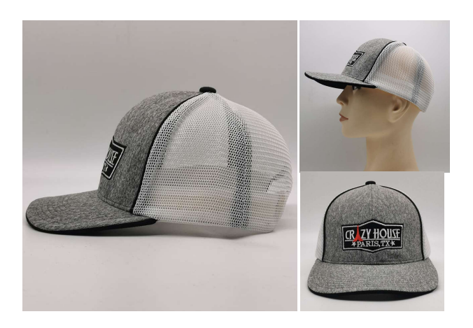
HY20947 Jersy on front&visor, mesh on back panel. Flat embroidery logo on front. Piping on both side.Mid Pro, Structured Shape. Cotton twill sweatband. Plastic buckle closure.