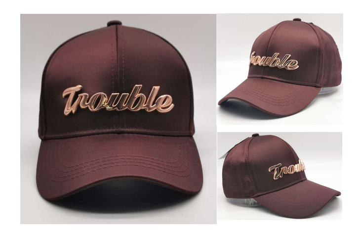
HY20939 Spandex satin , Big ingot on front. Mid Pro, Structured Shape. Metal buckle back closure. Polyester twill sweatband.