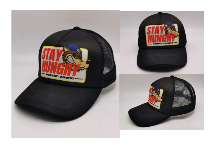
HY20969 Foam on front and visor, mesh on back panel, screen print on front panel. Mid Pro, Structured shape, plastic closure. Polyester twill fabric for sweatband.