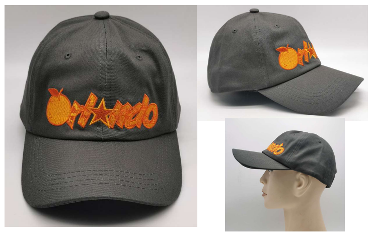
HY20938 Cotton twill fabric, unstructured, embroidery logo on front. Low Pro, soft shape, Slider buckle closure. Polyester twill fabric for sweatband.