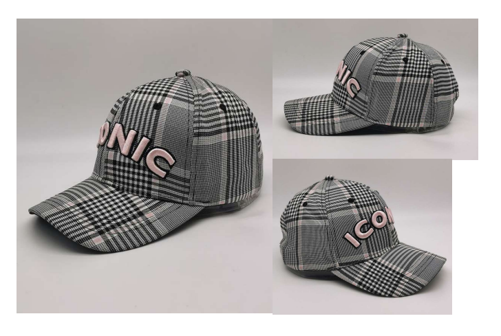
HY20954 Checked fabric, 3D embroidery logo on front panel. Mid Pro, Structured shape, Branded metal buckle closure. Branded print on inside tape. Polyester twill fabric for sweatband.