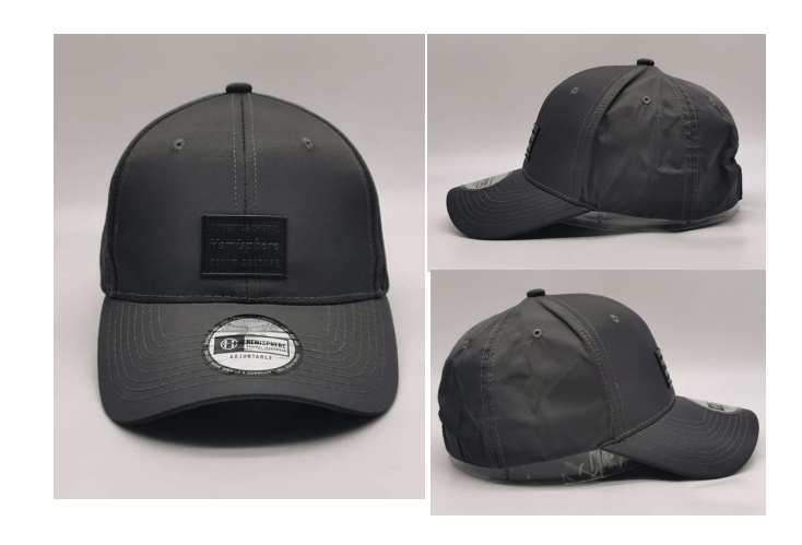
HY20948 Nylon fabric. PU lanel on front. Mid Pro, Structured Shape. Polyester twill sweatband. Branded print on inside tape. Ribbon tape with plastic buckle back closure.