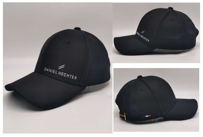
HY20946 Mesh fabric, TPU branding on front lefy panel, flag embroidery on right side and flat embroidery back tape. Branded print on inside tape. Mid Pro, Structured shape, Branded metal closure. Polyester twill fabric for sweatband.