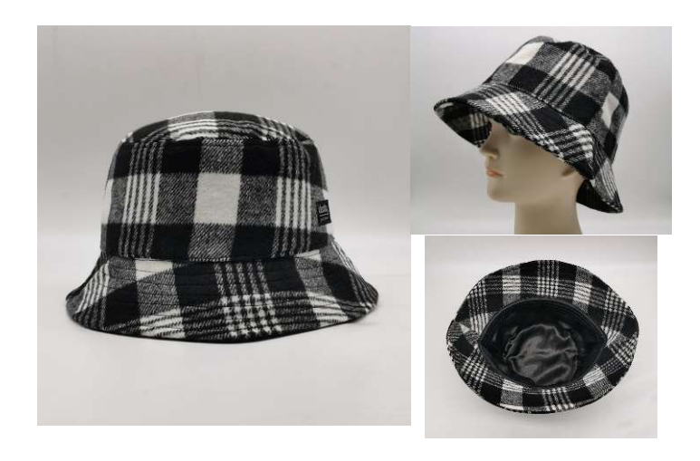
HY21010 Rpet winter checked fabric with satin lining bucket hat. Woven label on left side. Hat size 57cm.