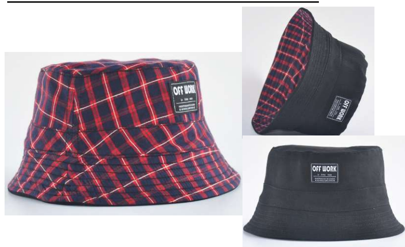
HY20999 Summer checked fabric & 100%cotton twill reversible bucket hat, woven label on both side. Hat size 58cm.