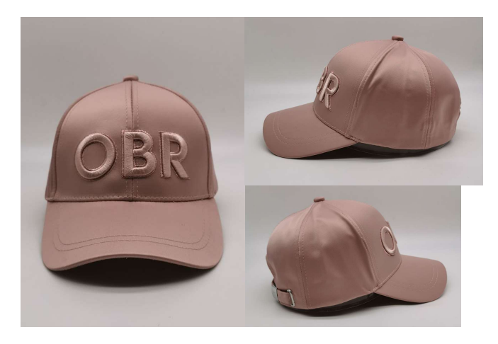
HY20974 Spandex satin, 3D embroidery on front panel. Mid Pro, Structured Shape. Branded print on inside tape. Branded metal buckle with self fabric. Polyester twill sweatband.