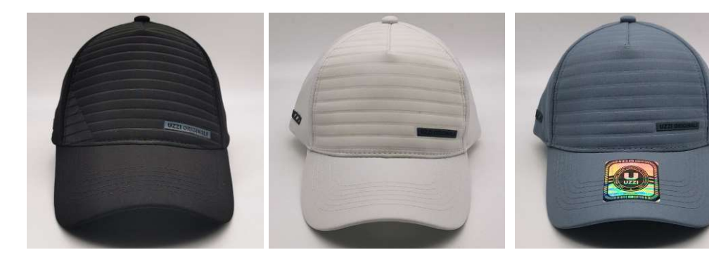
Other popular colors collection for the style: black, white, airforce