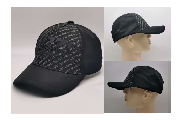
HY20952 Canvas and bylon fabric. Allover print and 3D rubber print on front panel Embroidery logo on front. Low Pro, Structured Shape. Polyester twill sweatband. Plastic buckle back closure.