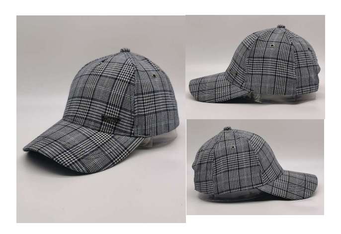
HY20955 Checked fabric, Ingot on left front panel. Mid Pro, Structured shape, plastic buckle closure. 6 pcs Metal eyelets on crown. Branded print on inside tape. Polyster twill fabric for sweatband.