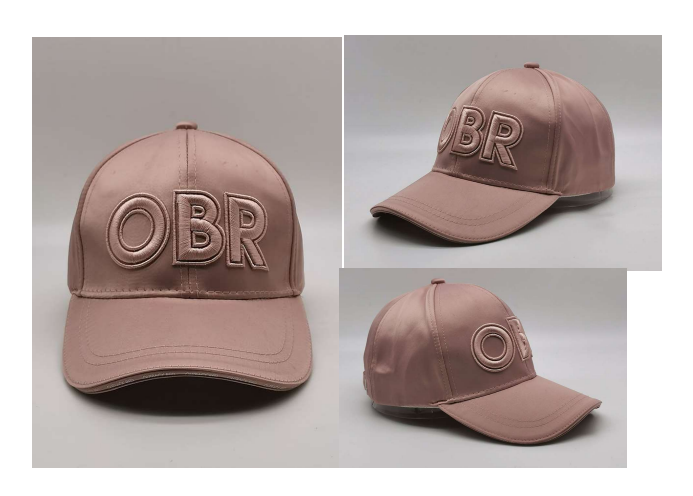
HY20975 Spandex satin, 3D embroidery on front panel. Mid Pro, Structured Shape. Branded print on inside tape. Branded metal buckle with self fabric. Polyester twill sweatband. Branded