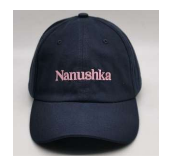
Other popular colors collection for the style: black, navy, pink