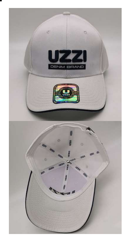
Other popular colors collection for the style: black, blue