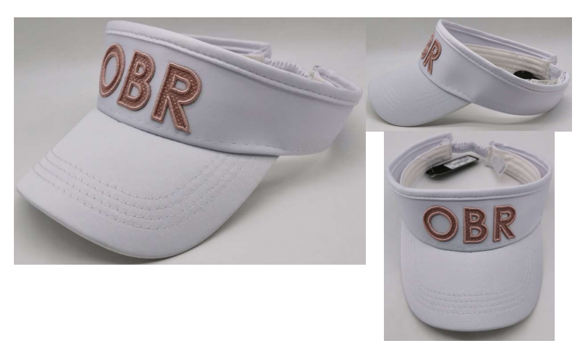
HY20961 White satin fabric, Embroidery logo on middle front panel. Elastic band closure.