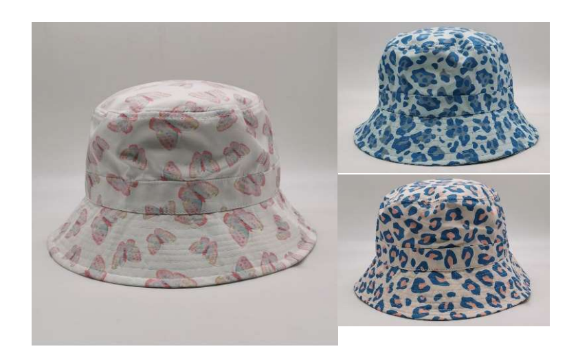
HY21008 Microfibler Digtal print fabric bucket hat. Hat size 57cm