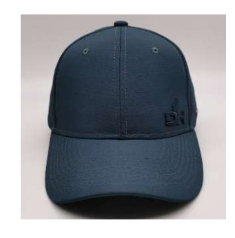
Other popular colors collection for the style: black, red, teal