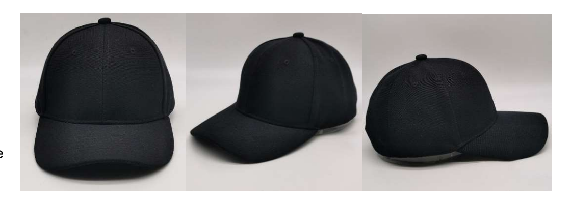
Other popular color collection for the style: black