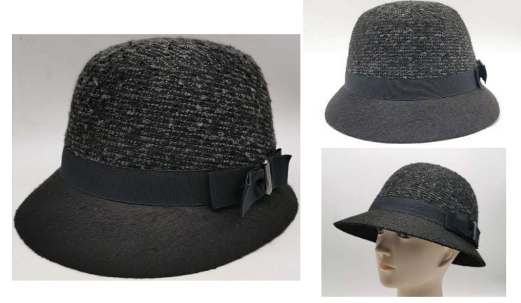
HY20972 Black/grey cloche hat. Black band with bow and metal ignot. Hat size 57cm.