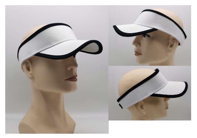
HY20994 White 100% cotton twill fabric. Polyester twill sweatband. Velcro back Closure. Binding around visor and crown.