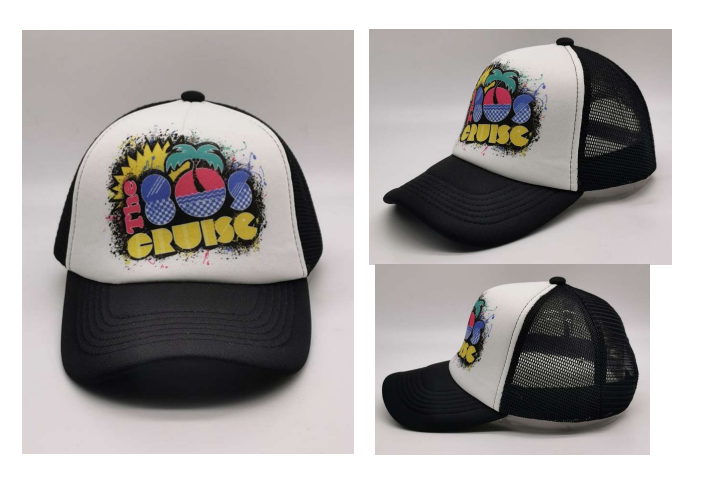
HY20970 Foam on front and visor, mesh on back panel, screen print on front panel. Mid Pro, Structured shape, plastic closure. Polyester twill fabric for sweatband.