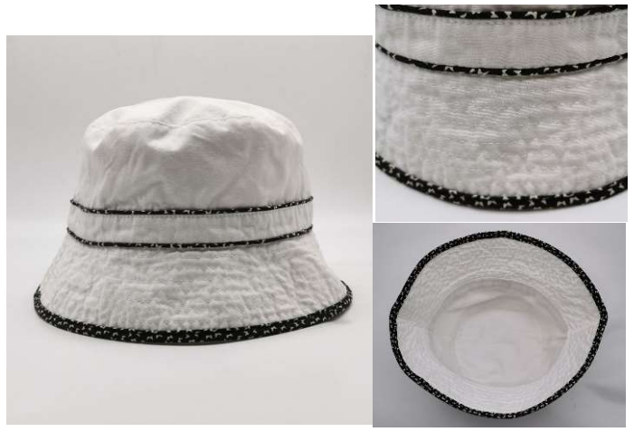
HY21011 Washed cotton canvas fabric reversible bucket hat. Flower fabric Piping and binding on and and brim. Hat size 57cm.