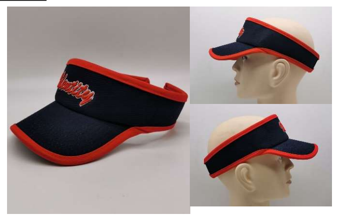
HY20958 Navy 100% cotton twill fabric,red edges piping, High density embroidered logo on middle front panel. Elastic band Closure.