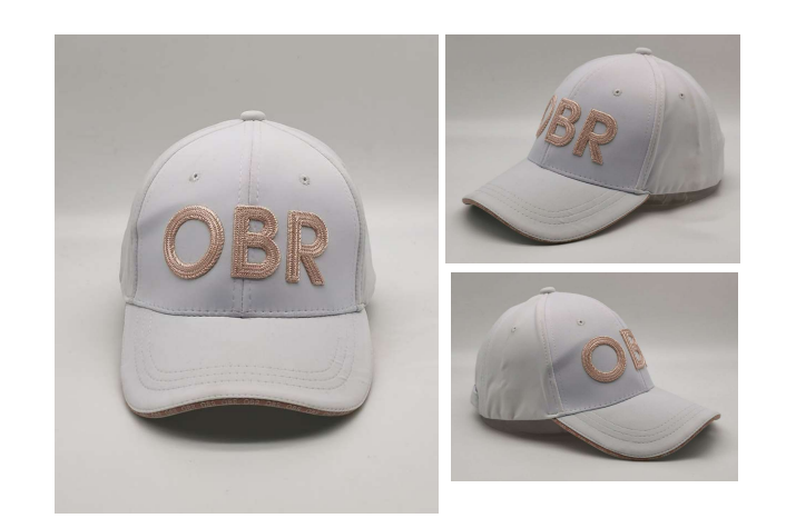
HY20976 Spandex knit fabric, 3D embroidery on front panel. Mid Pro, Structured Shape. Branded print on inside tape. Branded metal buckle with self fabric. Polyester twill sweatband. Branded sandwich.