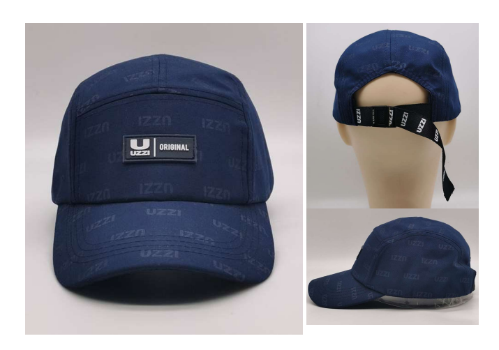
HY20951 Microfiber, Rubber label on front. Leisure shape, Branded print on inside tape. Branded ribbon tape with plastic buckle. Polyester twill for sweatband.