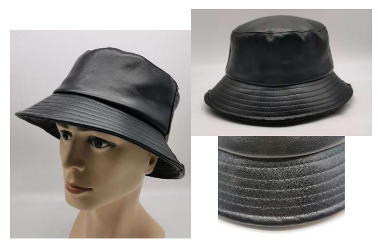
HY20973 PU bucket hat. Lining is polyester fabric. Hat size 58cm.