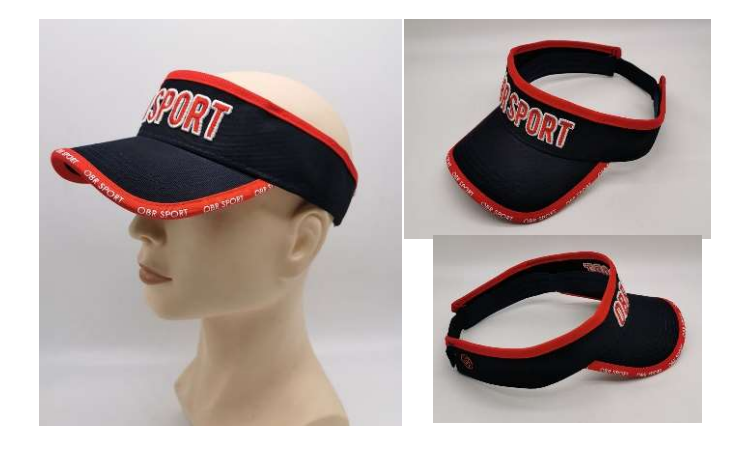
HY20995 Navy 100% cotton twill fabric, 3D & flat embroidered logo on middle front panel. Polyester twill sweatband. Elastic band Closure. Print at right back and binding on visor. Binding around visor and crown.