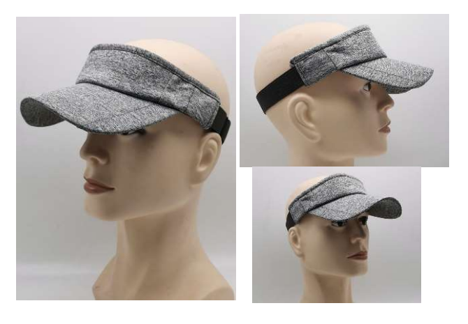
HY20959 Melange grey jersey fabric, Elastic band Closure.