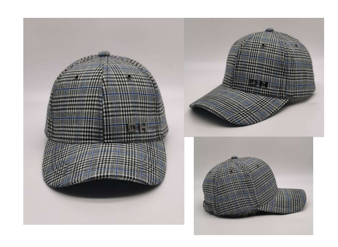
HY20956 Checked fabric, Ingot on left front panel. Mid Pro, Structured shape, Branded metal buckle closure. 6 pcs Metal eyelets on crown. Branded print on inside tape. Polyster twill fabric for sweatband.