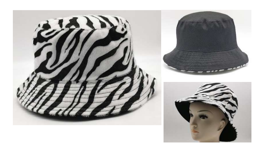
HY21000 Zebra print short fur with cotton twill reversible bucket hat. Hat size 58cm.