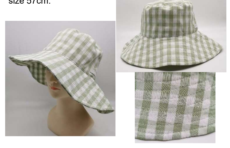
HY21012 Summer checked fabric floppy with T/C sheeting lining big brim bucket hat. PU label on left side. Hat size 57cm.