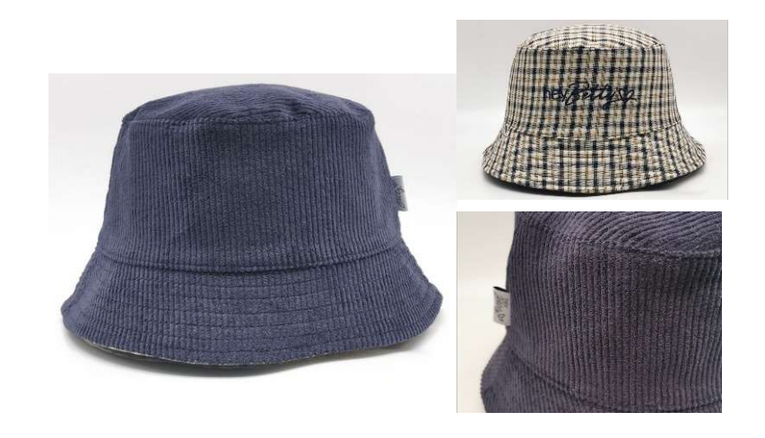
HY21002 Corduroy with checked fabric reversible bucket hat. woven label on outside, flat embroidry on inside. Hat size 57cm.